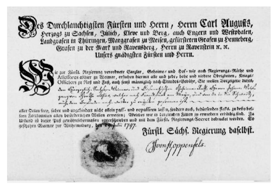
Fig. 2. Goethe's passport. GSA 25: XXIX, H, Bl. 77.

substrate of the law, as that which is "set-down" ( Gesetz ). Material setting and discursive sentencing co-construct the social entity called "the city." Instead of the permanent object with which one could interact, print's transactional nature lends it an experiential identity that one passes through . It does not live on as either document or evidence, but instead as a representation of a past passage. Such a transactional understanding of print is most concretely on display in the final printed item included in the folios of the Swiss Journey , Goethe's passport, which conjoins print, manuscript, and the institutional impression or seal into a single sheet all under the heading of corporal movement (fig. 2).