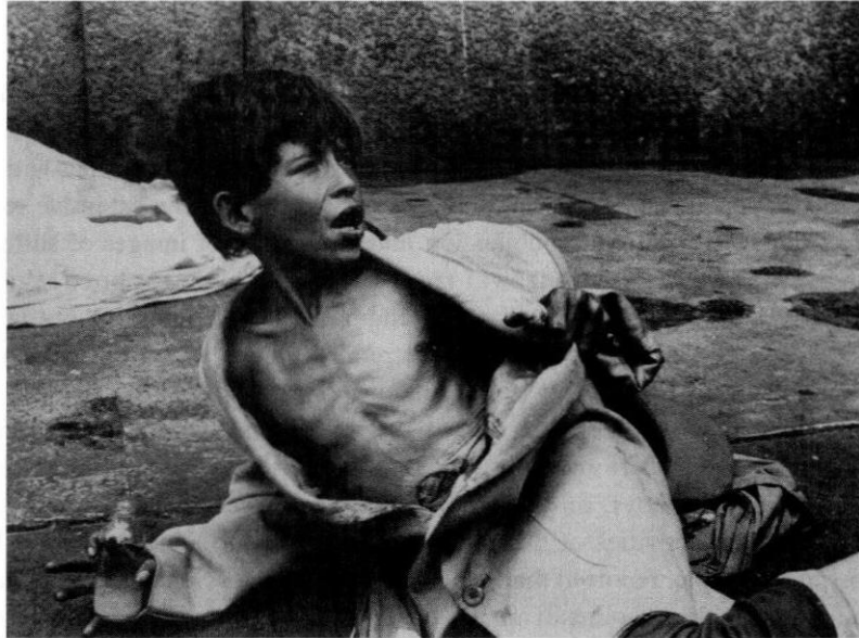
Picture 3. "When you look at this picture what do you see?" Street youth wounded in his stomach, Bogota, Colombia. Amnesty International advertisement, The Guardian, 14 May 1994.