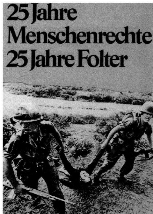
Picture 2. "25 Years of Human Rights: 25 Years of Torture." Poster for Amnesty International, 1976

Although symptomatic of the wider cultural conjuncture, this concession has not meant, however, a significant departure from the time-honoured visual strategy of humanitarianism, but rather a renegotiation of its relations with the traditional public sphere of print and audio-visual media. The extensive recent use of the Internet for the publication and circulation of images of suffering testifies not to their withdrawal from the public sphere, but rather to contemporary humanitarianism's rising emphasis on the public sphere of our age. The Internet is after all a type of public sphere which has presented humanitarian organizations with an immense new potential for accessibility, immediacy and mobilization, and at the same time has allowed them to dissociate themselves from the questionable and widely chastized practices of mass media. The latter, on the other hand, usually complement rather than antagonize the activities of humanitarian organizations. The American Red Cross, for example, reported that public contributions for Somalia rose in direct proportion to the amount of media coverage given the crisis (Moeller 99). Prominent, among this media coverage, was Time's four-page photo-essay entitled "Landscape of Death" (Picture 4). The question then remains: what is