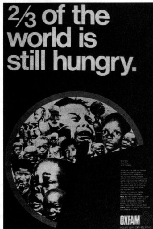
Picture 5. Oxfam campaigning poster, 1973.

The first, more immediately political sense of representation, has been widely challenged in recent decades. The repercussions of this challenge for the images in question, and their use by humanitarian organizations, were particularly severe. Many contemporary critics indignantly point out that the pictures of starvation and suffering, by representing the non-western world as uncivil, disordered and deprived, dependent for its survival on the mercy of the West, simply continue the patronizing rhetoric of colonialism. Morality, according to Enzensberger’s characteristic aphorism, “is the last resort of eurocentrism” (74). In response to this criticism, many aid agencies have revised their visual rhetoric by adopting a much more positive imagery. The difference, for example, between Oxfam’s campaign poster from the early 1970s (Picture 5), and that by the Swedish Aid Agency Lutherhjälpen, from the early 1980s